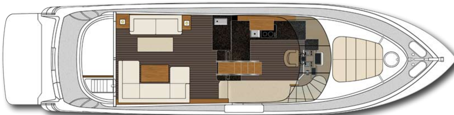
Main Deck Lower Helm Option